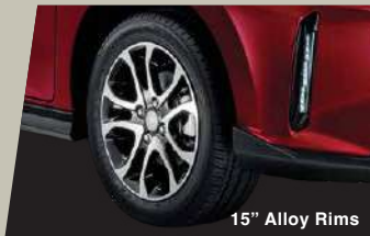
15" Alloy Rims