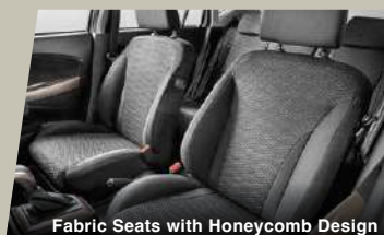
Fabric Seats with Honeycomb Design