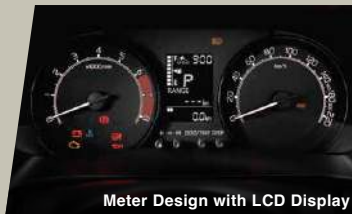
Meter Design with LCD Display