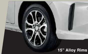
15" Alloy Rims