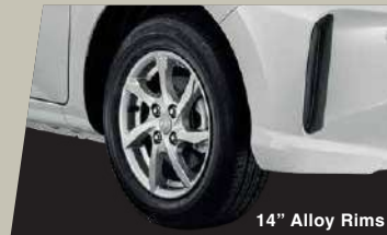
14" Alloy Rims