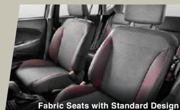
Fabric Seats with Standard Design