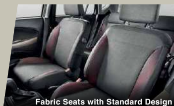
Fabric Seats with Standard Design