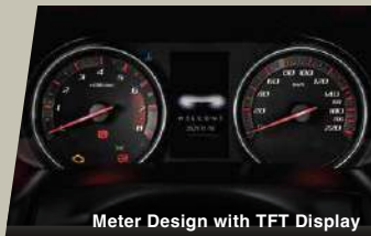
Meter Design with TFT Display