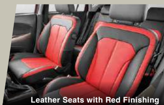
Leather Seats with Red Finishing