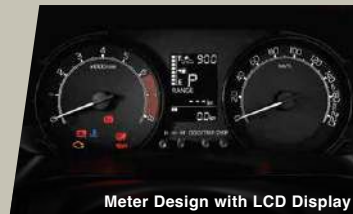
Meter Design with LCD Display