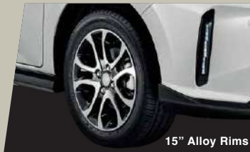
15" Alloy Rims